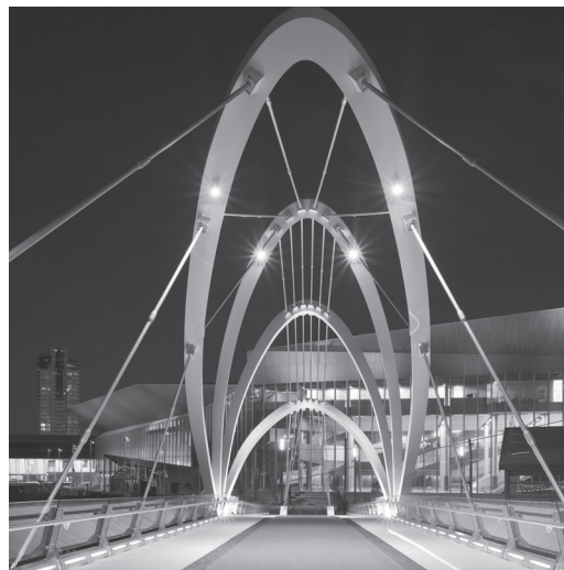
Melbourne Convention & Exhibition Centre