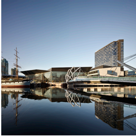
Melbourne Convention & Exhibition Centre